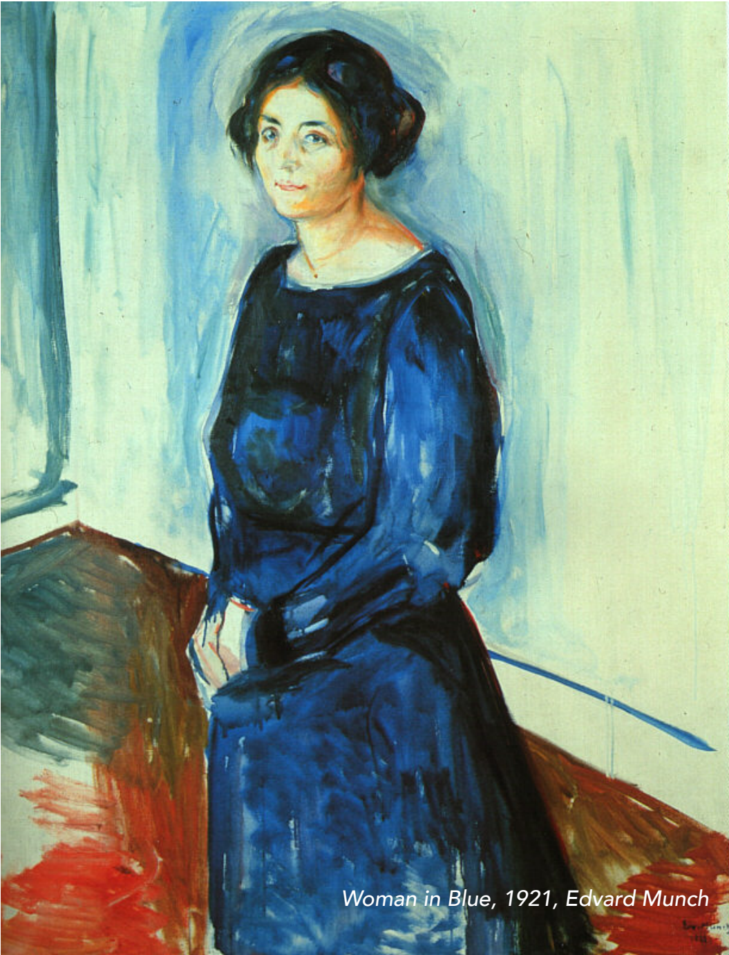
Woman in Blue, 1921, Edvard Munch