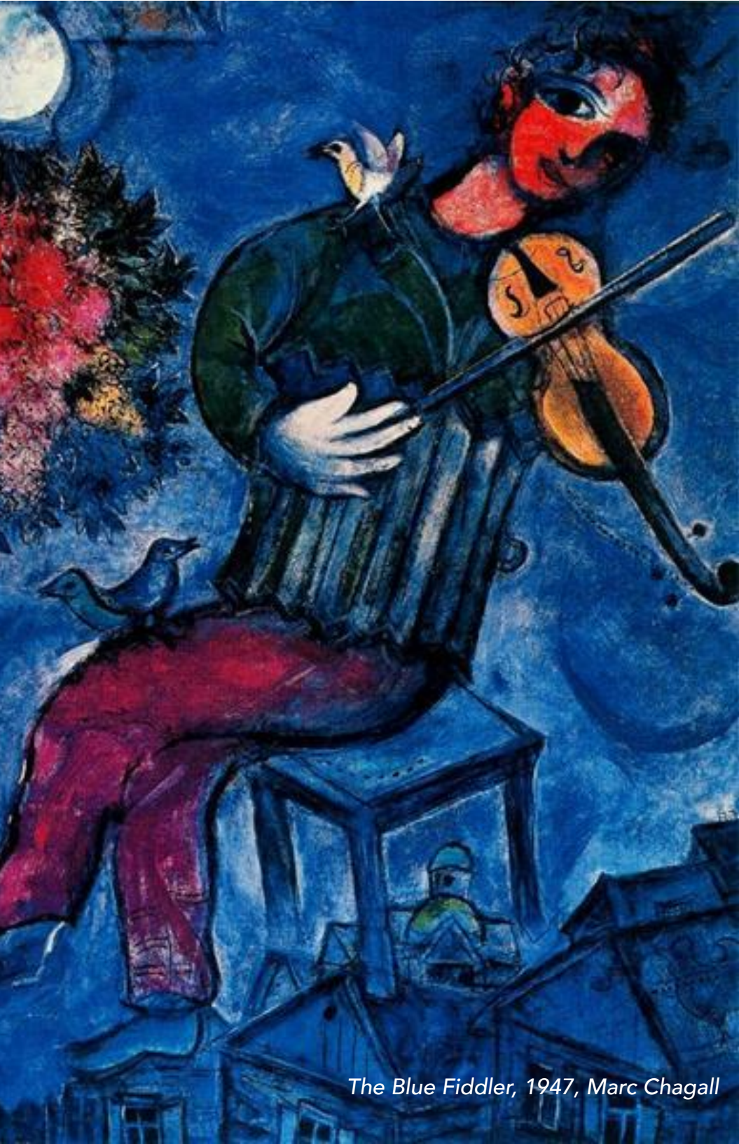
The Blue Fiddler, 1947, Marc Chagall